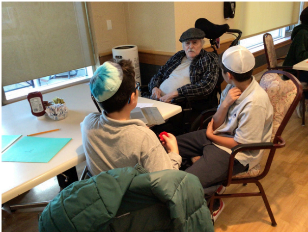
L'DOR VADOR MONTHLY PROGRAM WITH OJSC