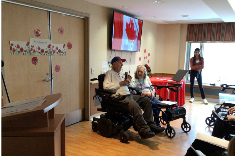
HONOURING REMEMBRANCE DAY