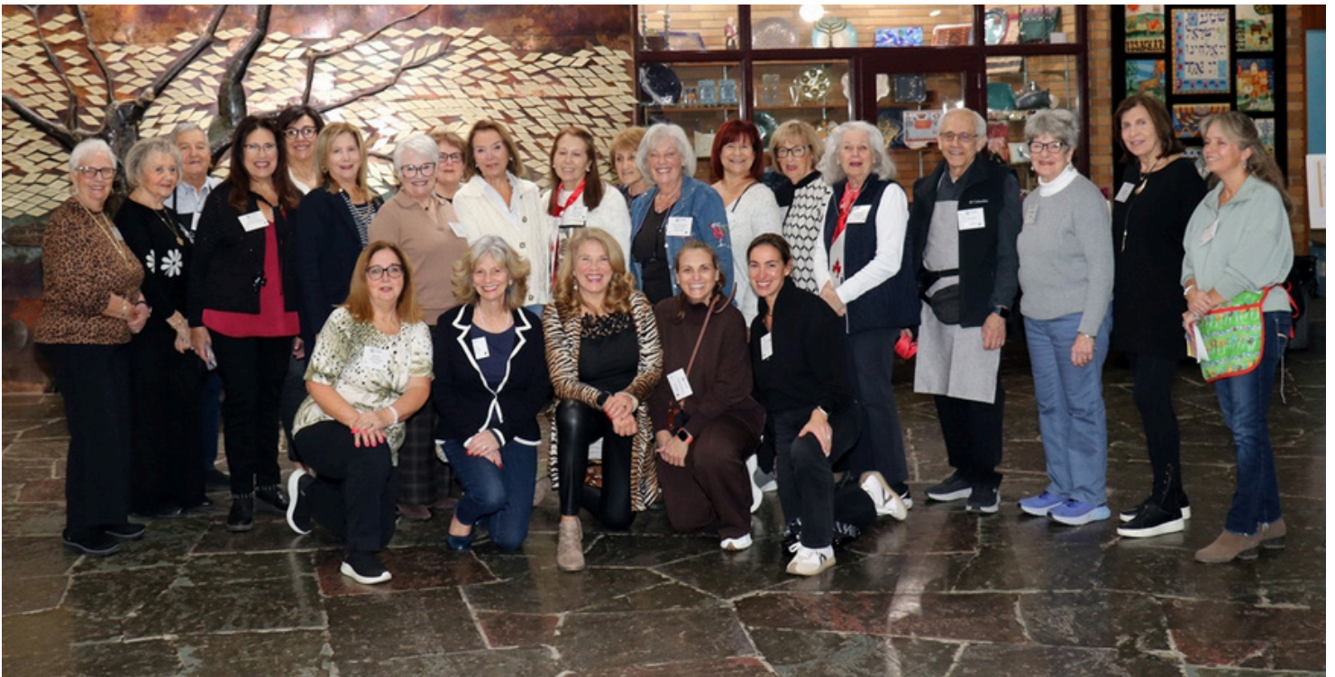
GREAT GAMES EVENTS 2025 VOLUNTEERS