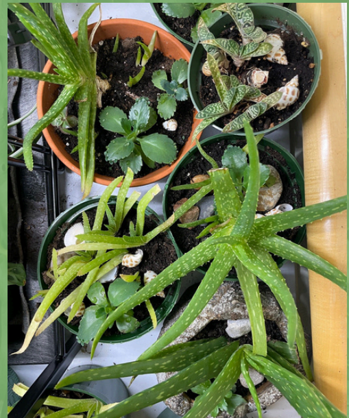
RESIDENT -CURATED MINI GARDENS

Help Hillel residents continue to nurture their green thumbs! All proceeds from the Festive Plant Sale will go toward purchasing an additional grow light.