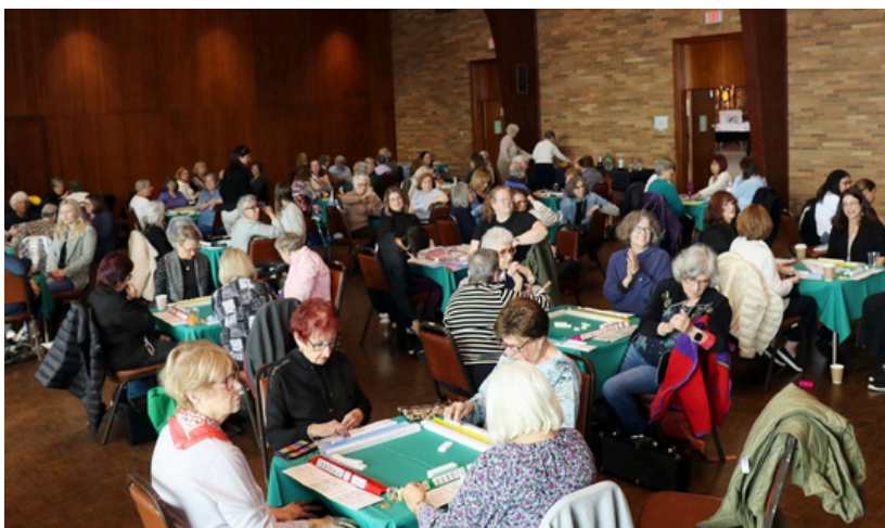
3RD ANNUAL GREAT GAMES EVENT NOVEMBER 2ND

The Auxiliary of Hillel Lodge is delighted to share the remarkable success of our 3rd Annual Great Games Event (GGE)! In our 60th year of dedicated service, this year's event drew a sold-out crowd of 200 enthusiastic participants and achieved an extraordinary fundraising milestone —$10,000 more than last year—through general attendance, our silent auction and raffle, table sponsorships, and individual generous donations.