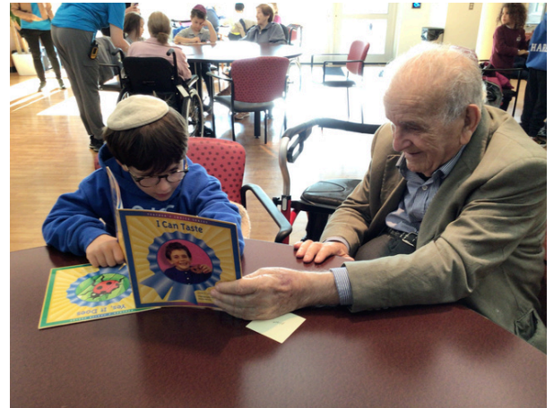
READING BUDDIES WITH OJCS GRADE 1 CLASS